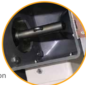
Prest Neo Application